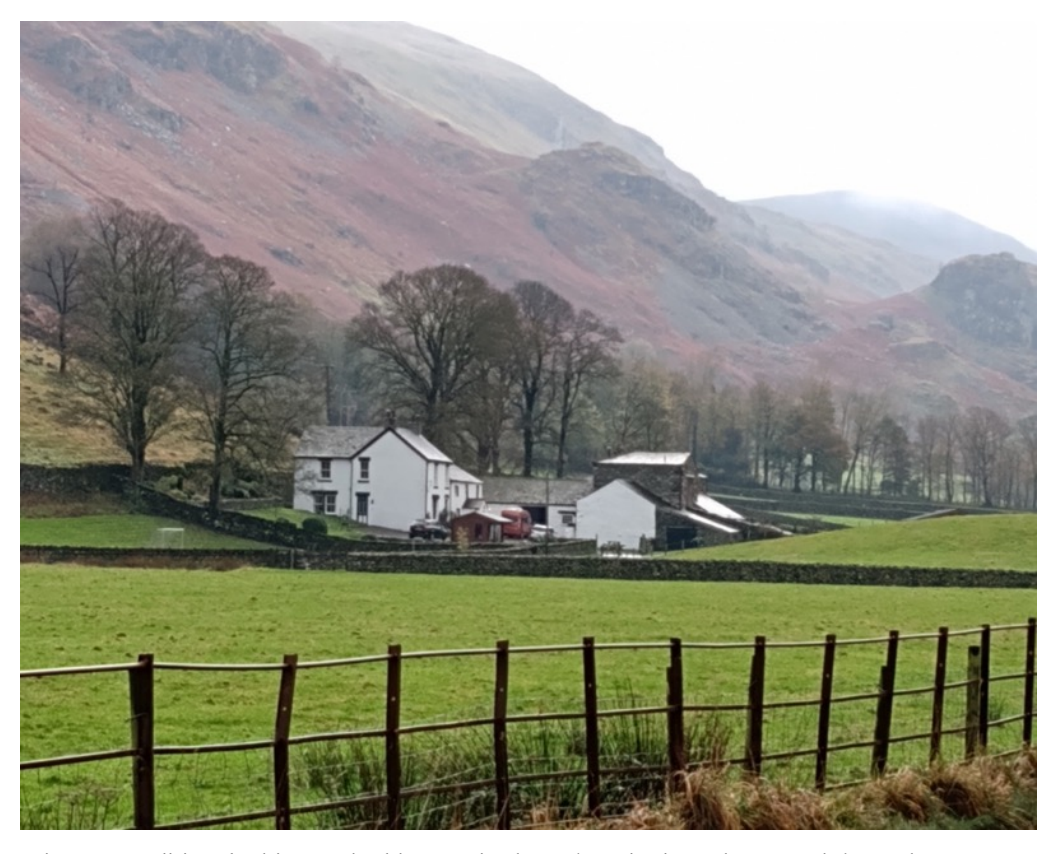
Figure 3 traditional white-washed houses in the Lake District

With much of the early medieval buildings having already been lost, the legacy of an 'agro-pastoral' existence struggled to survive with only small 'farms and hamlets, roads and tracks, churches and mills' still remaining (Winchester 2016: 56). The commonly white-washed farmsteads were to become the core of the Lakeland farming landscapes, historically distinguishing between the landholders who grew crops in the valleys and their tenants and other locals who grazed sheep and cattle on the open fells (see Figure 3). The fells were used as a commons and later dry-stone walls or hedges were used to demarcate boundaries between private and open land (Winchester 2016). These walls simultaneously provided a 'legal and spatial construct' important in the role of 'legal order' and in formalising understandings of property which were to be later ratified by the late eighteenth and nineteenth century parliamentary enclosure movement (Blomley 2004: 93; Whyte 2015). Walton (2013: 72) suggests that these enclosures on the fells (where they took place), 'brought about a significant transformation of the upland landscape, although even after the movement had passed, the Lake District was left with uniquely extensive areas of common land, especially in the most picturesque areas'.